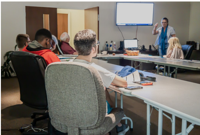
Transition students listen attentively during a workshop

training or assistance is needed, and assured them that a workstation with JAWS and ZoomText software along with a CCTV are available to use as needed.